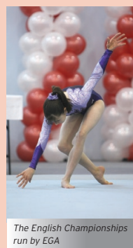
The English Championships run by EGA

The British and English Schools Gymnastics Associations primary roles are to support schools based competition at a UK regional level and to support those gymnasts that represent England at school based competitions both nationally and internationally. The BSGA and ESGA also provide their expertise and support in assisting the development and implementation of schools based programmes such as Key Step and Next Step competitions. The BSGA is an affiliate of British Gymnastics. Schools can now register, for free, online at www.british-gymnastics.org